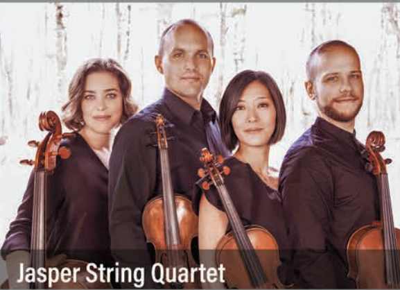
Jasper String Quartet

Sunday, April 27, 2025 at 4 PM Temple Ohev Sholom