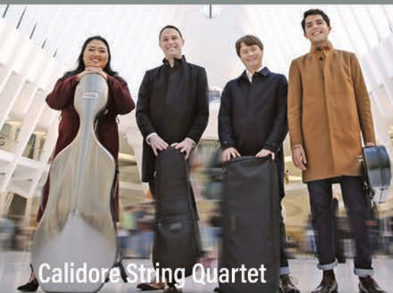
Calidore String Quartet

Wednesday, September 25, 2024 at 7:30 PM Temple Ohev Sholom