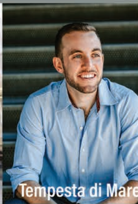
Tempesta di Mare

Saturday, November 9, 2024 at 7:30 PM St. Michael Lutheran Church